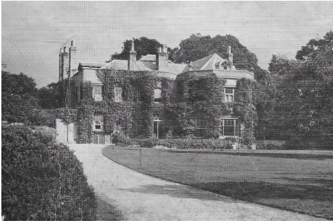
Lower Park, Dedham in 1957