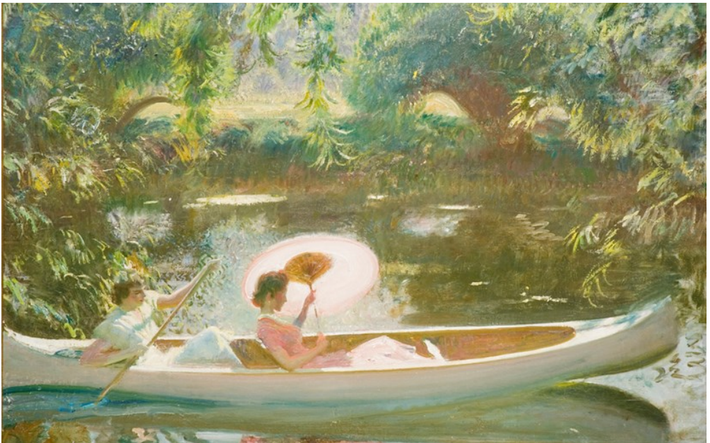
September Afternoon, 1939, by Sir Alfred Munnings