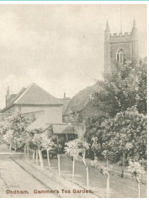
Gammer's Tea Garden behind ly House in the early 20th century

condition of the sale was that the original sash windows which he had removed should be reinstated. One can