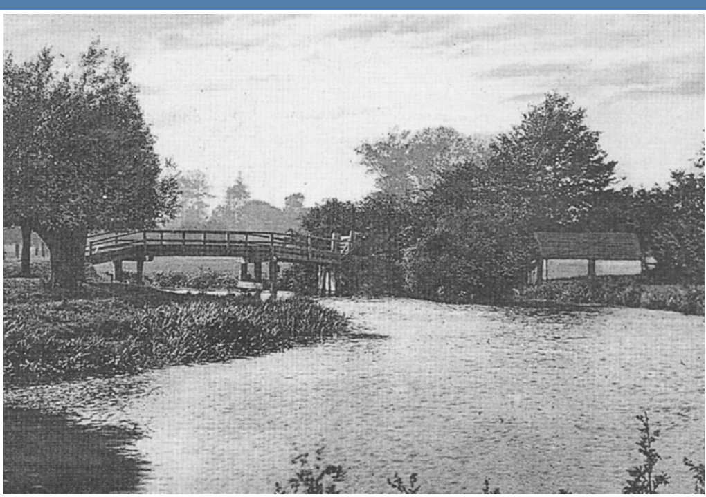
Fen Bridge in the early twentieth century. Lifting the new Fen Bridge into place, February 1985