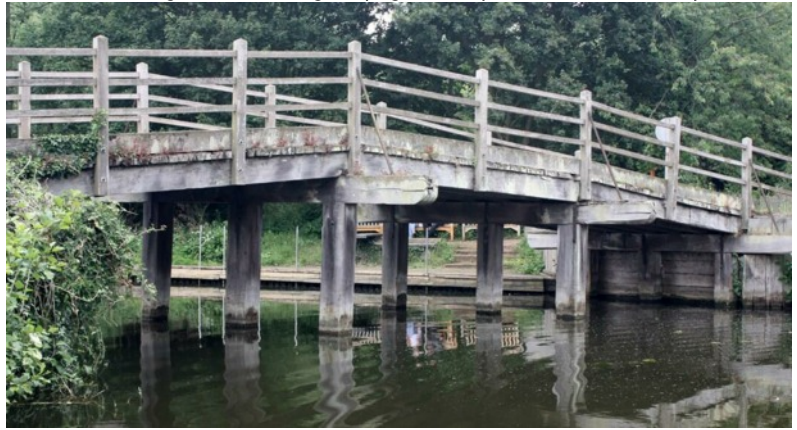
Flatford bridge, a replica of the original bridge constructed in Burmese wood in 1951, illustrating the traditional construction of bridges along the Stour