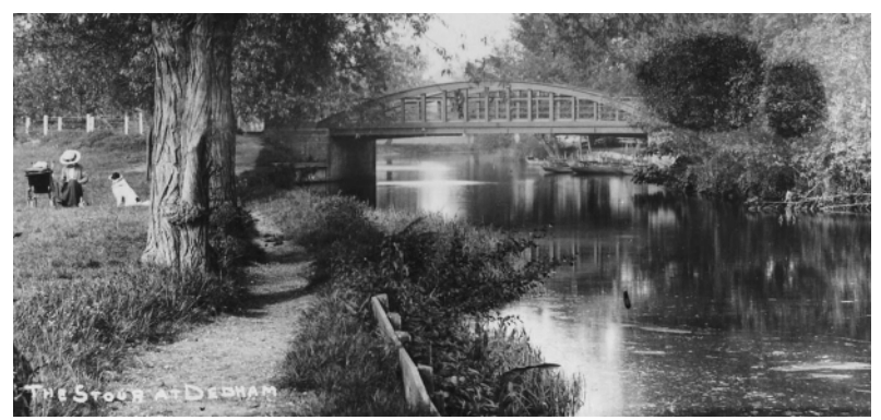
Dedham's iron bridge installed in 1900.