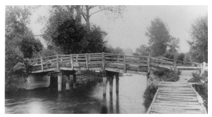
Dedham bridge in 1898, showing its central opening with three supporting posts on either side. On the right is the decking carrying the tow path across the tributary.